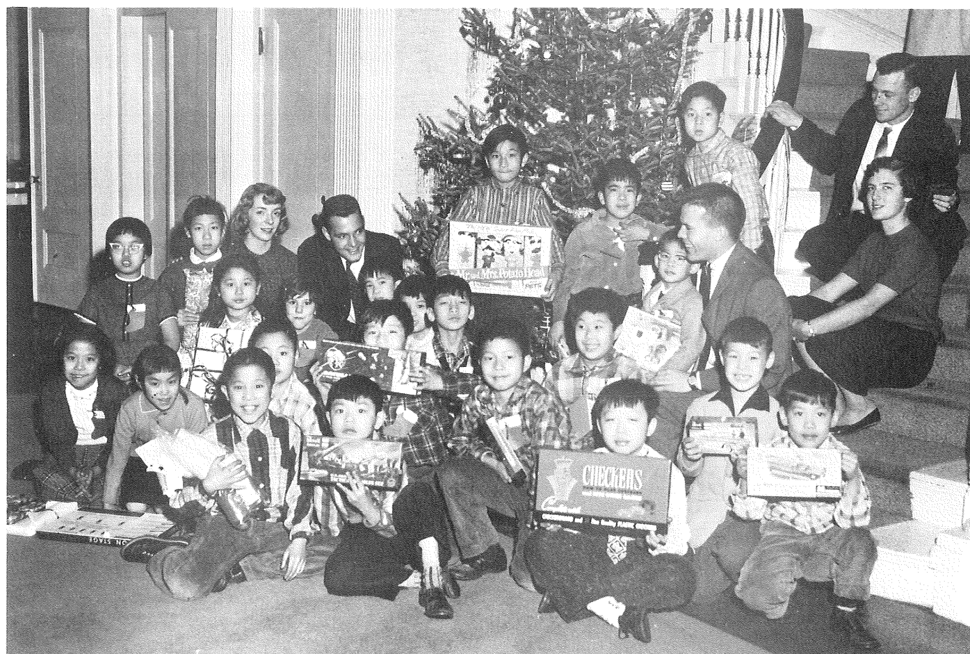
Charitable Betas spread holiday cheer. (Names unknown.)