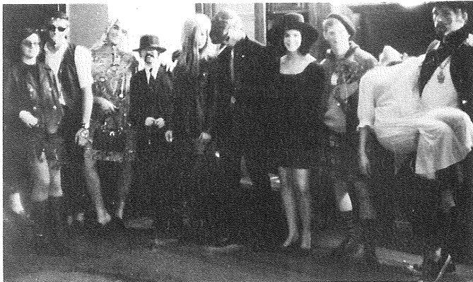
Remember this? Wild and crazy Betas. (Names unknown.)