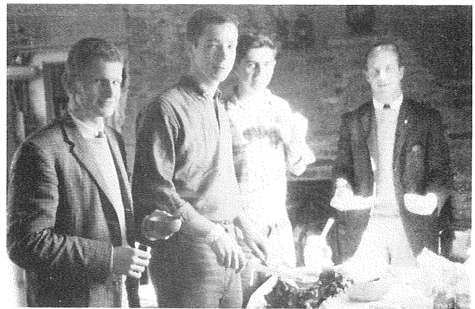
A Beta banquet. (Names unknown.)