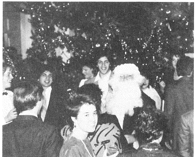
Top: Although putting it up is always a monumental effort, the Beta Christmas tree is well worth it. Bottom: A new surprise at this year's Christmas party—Santa!