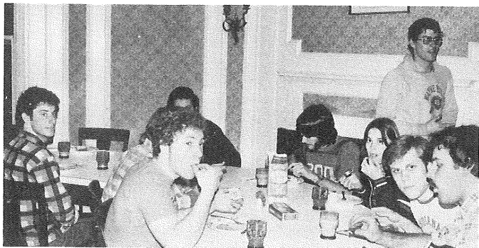
Betas at dinner. Will they ever change?