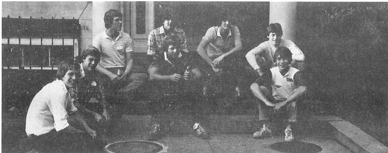
The ever-popular front steps.

Beta Upsilon Chapter of Beta Theta Pi at MIT