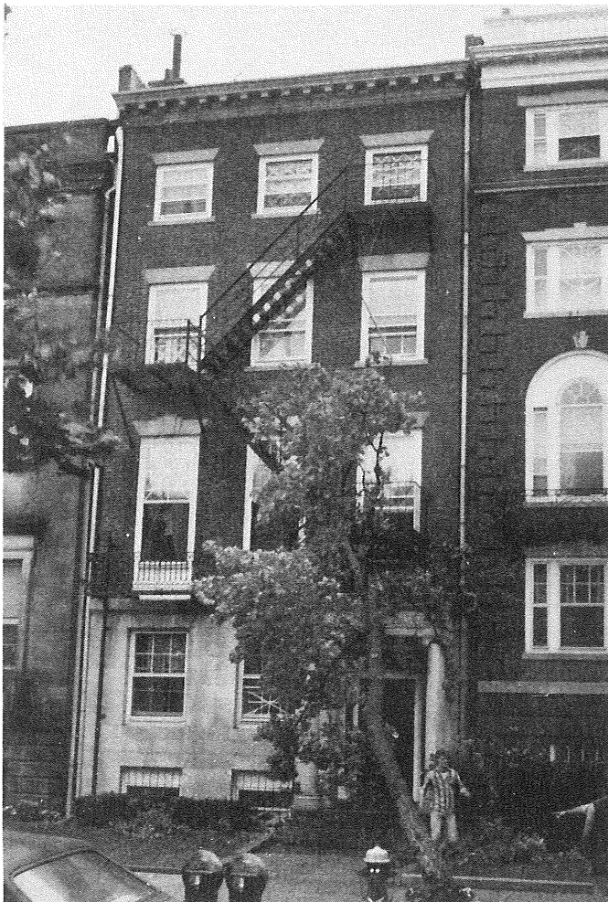
Hurricane Gloria left a tree on our fire escape!

We'd love to hear from you! Please don't forget to return the enclosed newsform!