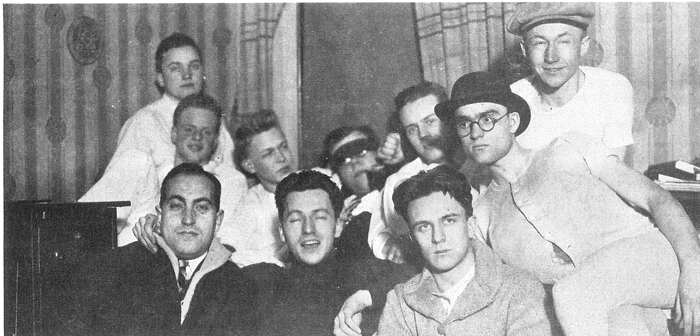
Once again, can you help identify these Betas?