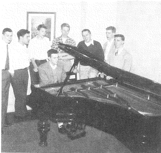
A '50s flashback . . .

When the directory is completed, a copy will be mailed to each brother. We believe the directory will be of great interest to alumni, as it will be an update on the whereabouts of many friends whom you may not have heard from in many years. Please help us make the directory as complete as possible by returning your information today.