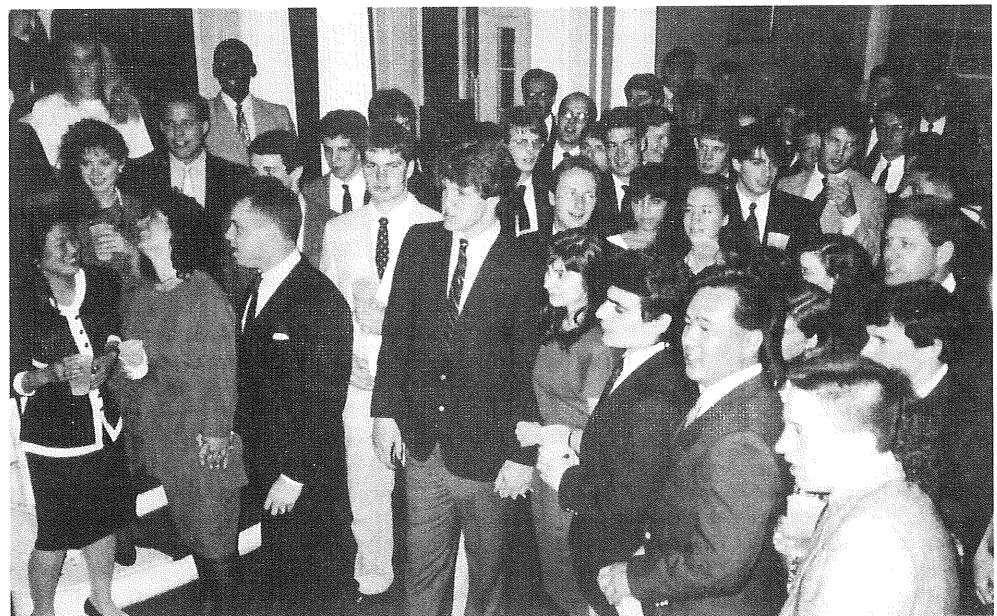
A good time was had by all at the annual alumni party last May.

Meet the new pledges – story on page three!