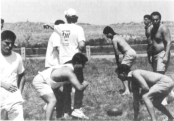
Betas and the URI colony playing football at the spring house trip.