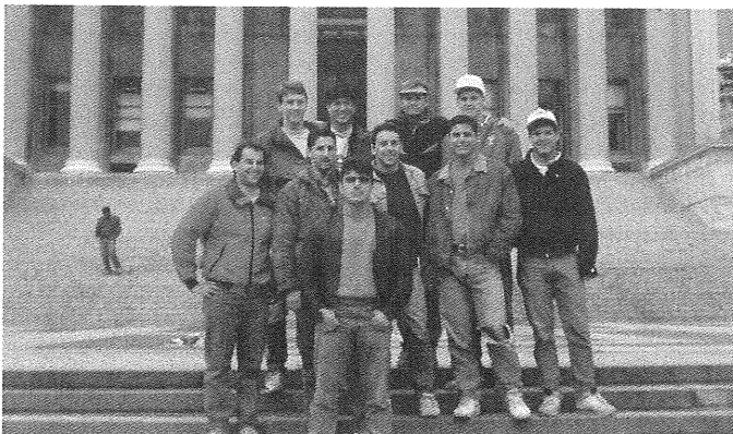
Members of the class of '92 on their "junior sneak" to New York City last spring.