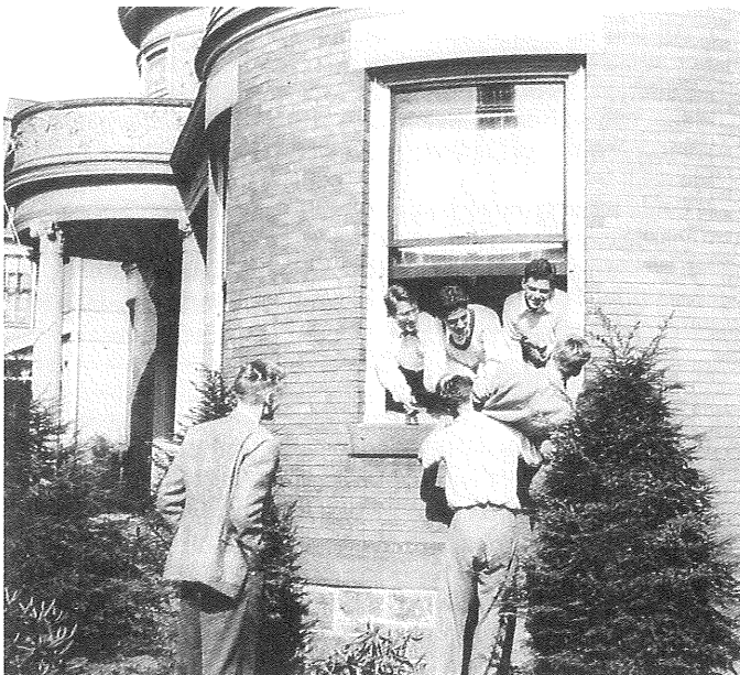
Beta brothers are up to no good as they pass a pledge (?) through a window at the old Kent Street house.