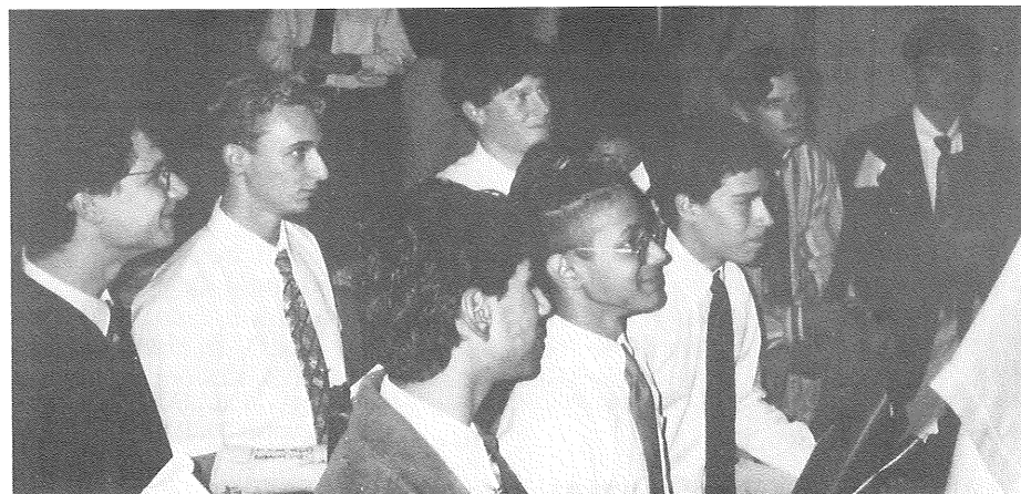
Below: Pledges sing "Beta Sweetheart" to rush women.