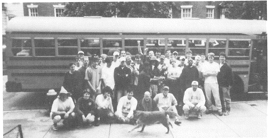
Brothers, alumni, pledges, and friends before the house trip to URI this fall.