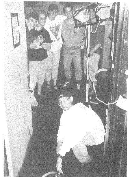
Brothers and pledges clean the annex basement after flooding from the worst rainstorm in years.