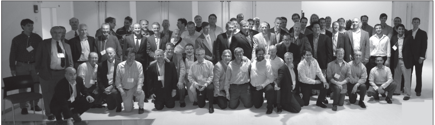
Beta Upsilon brothers celebrate the chapter's centennial at the MIT Media Lab.

From October 4-6, 2013, more than 170 Betas and guests celebrated the 100th anniversary of the Beta Upsilon Chapter of Beta Theta Pi at MIT. Coming from around the country and across the Atlantic, MIT Betas renewed old acquaintances and made new ones during days of celebration.