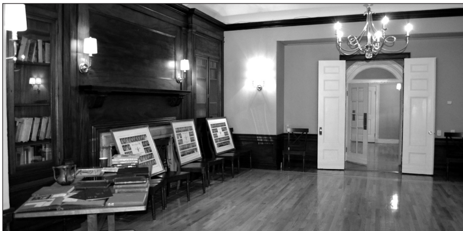
The library/chapter room in 119 Bay State Road.